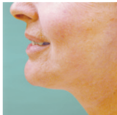
Actual Patient 7 Days After MACS-Lift