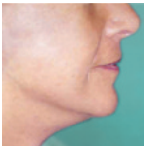
Actual Patient 7 Days After MACS-Lift