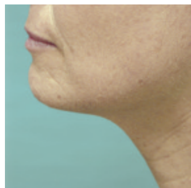
Actual Patient 7 Days After MACS-Lift